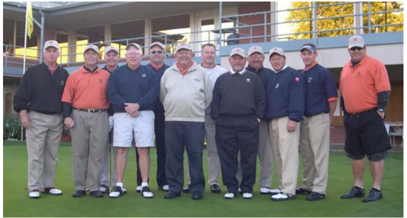
IMAA 2 STATE CHALLENGE TEAM

On October 4th, the IMAA Golf Team met our Ohio counterparts at Elcona Country Club near Elkhart, Indiana for the 2 State Golf Challenge. IMAA was victorious, but as you may remember, the previous two years OAIMA had taken home the trophy. We decided it was time to change that and with the help of talented teammates and one of our own (name withheld to protect everyone) playing for Ohio, we sealed the victory.